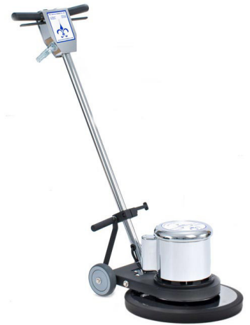
17 Inch Standard Unit Pictured Above

Non-marking 360-degree wraparound -and-under snug- fit bumper- no tools needed for replacement