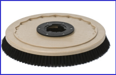
Nylon or Poly Brush