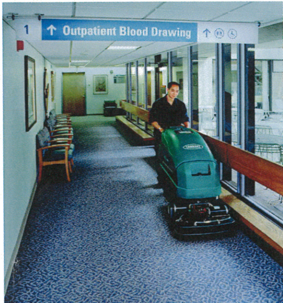
Ideal for large area, low moisture extraction