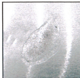
Encap-Ox dries clean and virtually clear.