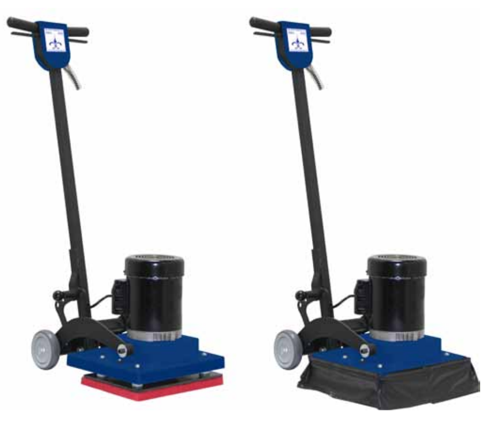
(Shown with dust skirt installed)

The TigerHawk 1410's revolutionary rectangular, floating head design allows the operator to easily maneuver the unit with less fatigue than the normal oscillating units available on today's market. It also enables access to corners while standing, unlike conventional floor machines.