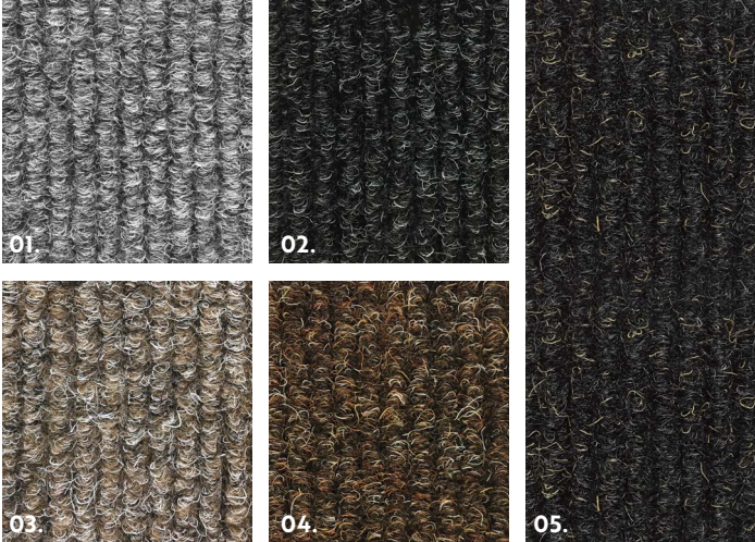
01. Sterling 2344 02. Charcoal 1198 03. Beige 1153 04. Harvest 1244 05. Black Shadow 2343