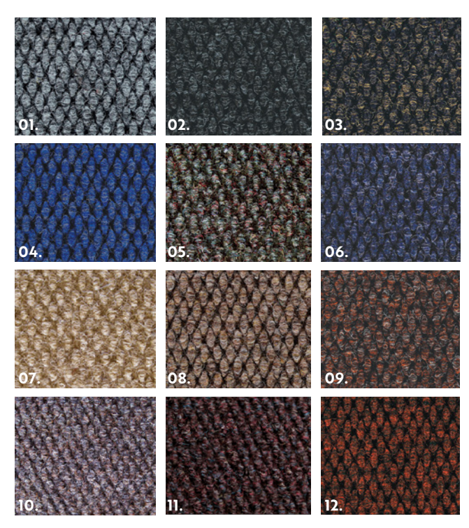
01. Sterling 2344 02. Anthracite 907 03. Black Shadow 2343 04. Azure 5181 05. Aspen 6265 06. Midnight Blue 5154 07. Sisal 1099 08. Beige 918 09. Chocolate 912 10. Harvest 1244 11. Bordeaux 7178 12. Cardinal Red 3353