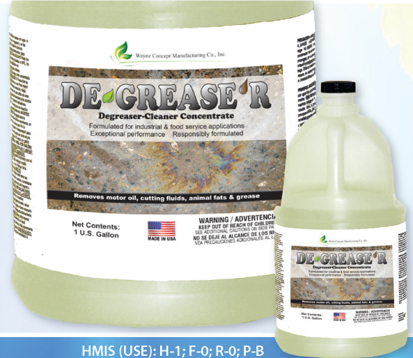
HMIS (USE): H-1; F-0; R-0; P-B